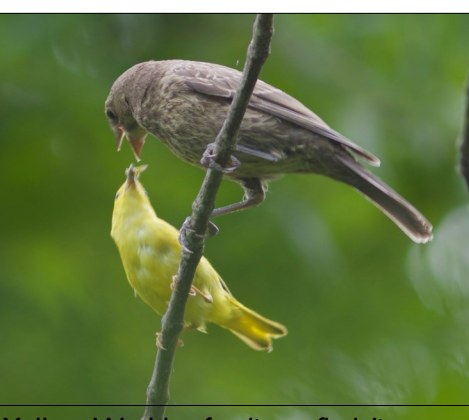
Yellow Warbler feeding a fledgling Cowbird.

ments, Cowbirds and other brood parasites that spend too much time with their foster families end up learning their host species' songs, picking up their behaviors, and attempting to mate with them. In the wild, though, they're somehow able to resist this - by the time they're about a month old, they've learned to act like Cowbirds, and they know to mate with their own species. If the true parents have abandoned the eggs and chicks, how is this conditioning taking place?